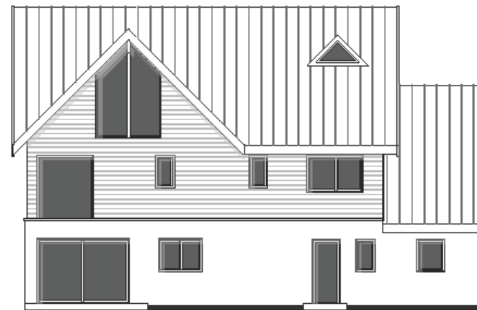
Proposed rear elevation scale 1:100@A2