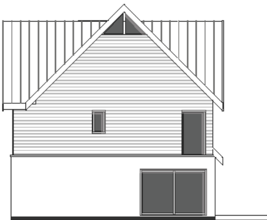
Proposed side elevation scale 1:100@A2