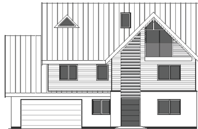
Proposed front elevation scale 1:100@A2